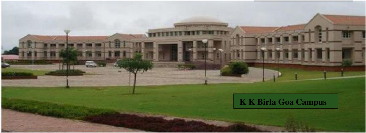
K K Birla Goa Campus