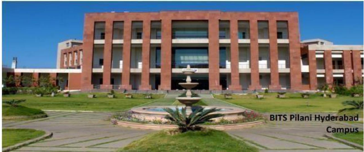
BITS Pilani Hyderabad Campus